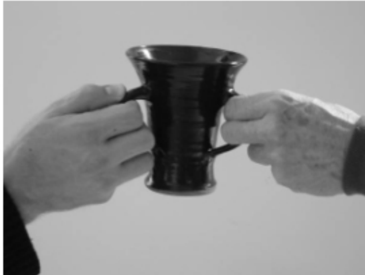
Figure 2. The Tyg: Three handled drinking cup making it easy to pass from one person to another. The third handle is invisible, being directly behind the tyg in this photograph. (Photo by D. A. Norman).

The tyg is an example of a product whose primary design consideration is utilitarian. In other cases, it is can be more difficult to separate function from appearance. One would think that kettles for boiling water should be relatively simple and highly utilitarian. One might think that the primary consideration in the design of a kettle design would that of utility: the thing should be an effective device for boiling water and pouring it. However, the basic kettle has several unintended consequences that induce negative emotions in users – emotions by accident. In particular, users can burn themselves for a variety of reasons: the handles can become uncomfortably hot, the steam from the boiling water might scald the user, and the kettle might drip during pouring. Through experiences with unsatisfactory kettles, designers have sought to eliminate these unintended negative consequences and their attendant emotions.