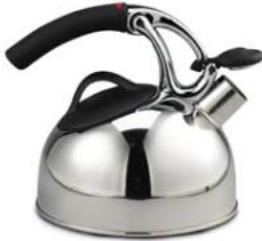
Figure 4. OXO Good grips uplift kettle. This kettle, from the same manufacturer as the one shown in Figure 3, overcomes its problem. The handle is heat resistant, and the lid over the spout opens automatically simply by tilting the teapot, so no finger can get burned.

The advertising copy for this kettle (from the OXO company website) describes the kettle in very utilitarian terms: