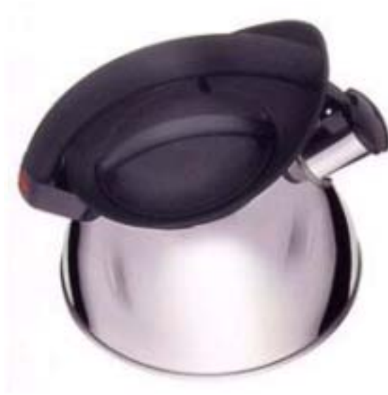
Figure 3: A utilitarian kettle (the OXO Good Grips tea kettle). The shield is designed to prevent steam from burning the hand.

Thus, even when motivated primarily by considerations of utility, the designer may sometimes be concerned about potential undesirable consequences, and therefore about emotions. In such cases, we say the designer's stance vis à vis emotions is one of emotion-prevention. Consider, for example, the kettle shown in Figure 3. Such a kettle could function perfectly well (and would be easier to construct) if it were made of a single material such as stainless steel. But this would allow the handle to get hot. But notice that the choice of a non-conducting material for the handle can be motivated by either the utility-focused goal of preventing users from burning their hands, or by the emotion-focused goal of preventing the resultant anger. In either case, the end result would be the same.